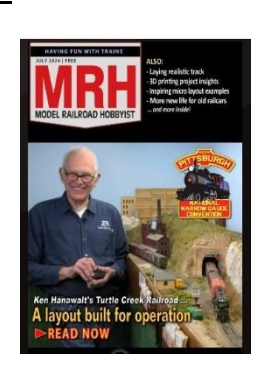
44th National Narrow Gauge Convention <a href="https://www.44nngc.com/">https://www.44nngc.com/</a>